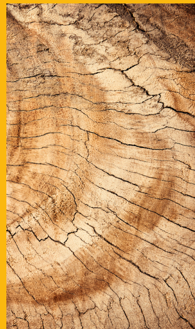
Timber or Tile Base