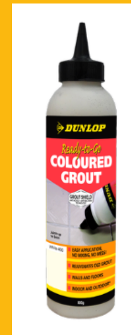
Ready To Go Grout