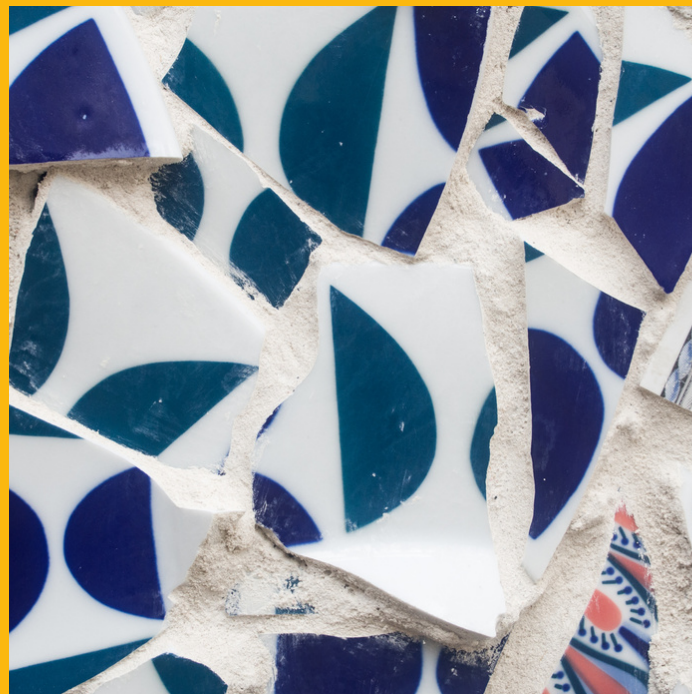
Broken Tiles, Cups and Saucers