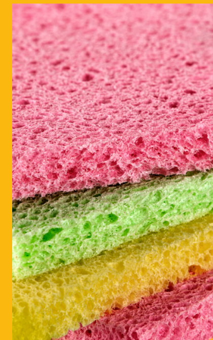
Sponges, Mixers and Spatulas